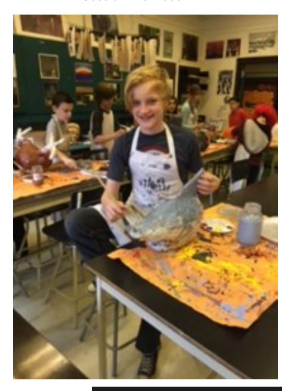
Shark Attack with paper maché

After School Art Programs - our Art programs are well under way, in fact we have only one week left to finish up this session. Stay tuned for the Spring Session information.