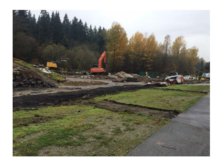
Construction zone—D building is gone!